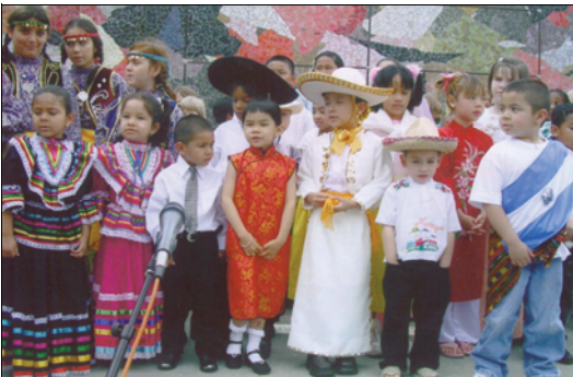
Children performing at Cinco de Mayo.

Global warming is especially insidious because of its slow-motion nature. Because of what scientists call "thermal inertia," we do not feel the heat resulting from greenhouse gases' emission in the air until a half-century after the fact. In the oceans, the lag time is much greater. Thus, given "business as usual," by the end of this century sea level may rise one to three feet, but the amount of sea-level rise "in the pipeline" – that is, guaranteed but not yet realized – may approach 25 feet. Hundreds of millions of people around the world will be in danger, including many of our fellow citizens in Seattle. We must adopt a more inclusive and collective way of life by overcoming the old and divisive paradigms of individualism, selfishness, and egoism. Racial and class superiority must be eradicated, for if one of us can't breathe neither can the other no matter how privileged one may be.