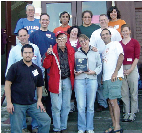
Day of Caring volunteers from Microsoft.